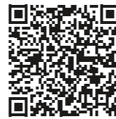
Scan the QR code and watch our FIBRE THERM video.

“FIBRE THERM standardises fibre analysis in feedstuffs, reaching a new level of quality, making it more economical, more precise and more reliable.”