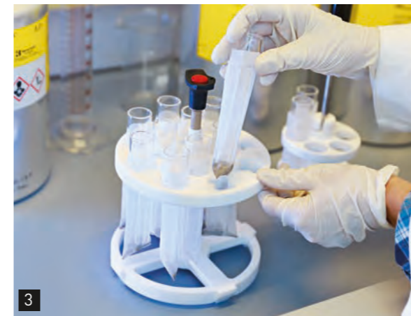
When the FibreBags are inserted into the sample carousel, they are automatically clamped firmly in place.