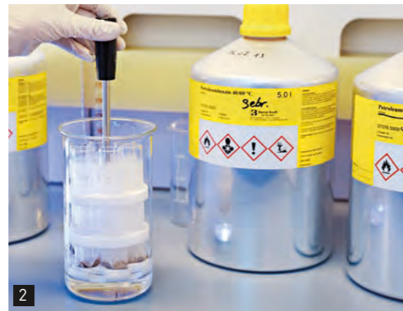
Convenient, time-saving degreasing with solvents in the degreasing module. 6 samples can be treated at the same time.