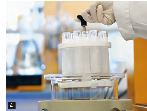
The removable handle makes it easier to insert and remove the sample carousel.