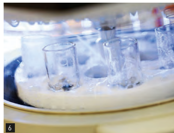
The rotating sample carousel ensures optimum bathing of the sample. The rotation is generated by the jet of detergent.