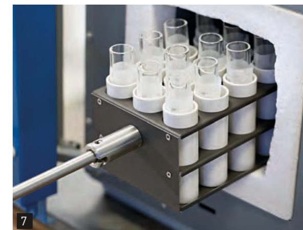
The incinerating module with a long handle makes handling of samples easier.